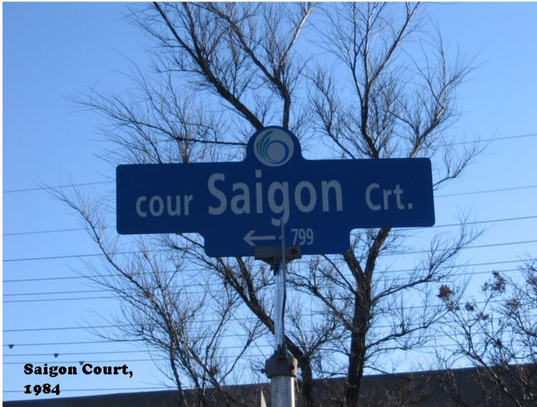
Saigon Court, 1984